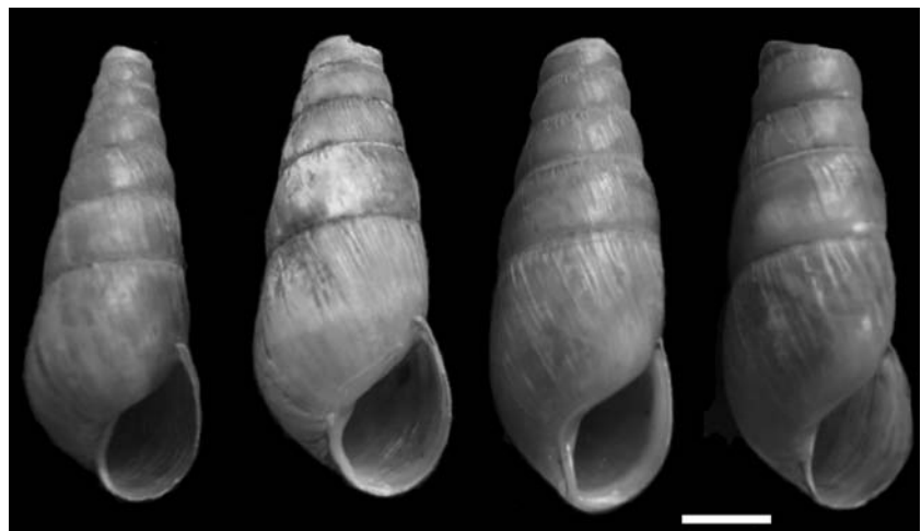
Fig. 2 Shells of Rumina decollata from Mendoza city, Argentina. Scale bar: 0.5 cm

Shell height varied between 1.68 and 2.53 mm (average 2.18 \pm 0.27 cm) and exhibited 4–7 whorls (Fig. 2). These dimensions are consistent with the usual sizes reported for specimens from other countries (see Carr 2002). Little is known of the ecology and behavior of R. decollata . It is considered an omnivorous snail that preys upon plants and other snails. It has a pronounced predilection for dry climates, while rejects wet ones (Moreno-Rueda 2002). Juveniles grow rapidly and exhibit a high survival rate (Miquel et al. 1995). By reason of its extensive range and regional abundance, R. decollata ranks as one of the most successful colonizing snails in North America (Selander and Kaufman 1973). According to its invasive potential, the presence of R. decollata may constitute a serious threat for the horticultural productivity. In Argentina, isolated cases of predation on black mulberries, Morus nigra , and garden nasturtium, Tropaeolum majus , have already been reported (Miquel 1988). In addition, R. decollata can prey eggs and juveniles of autochthonous molluscs and,